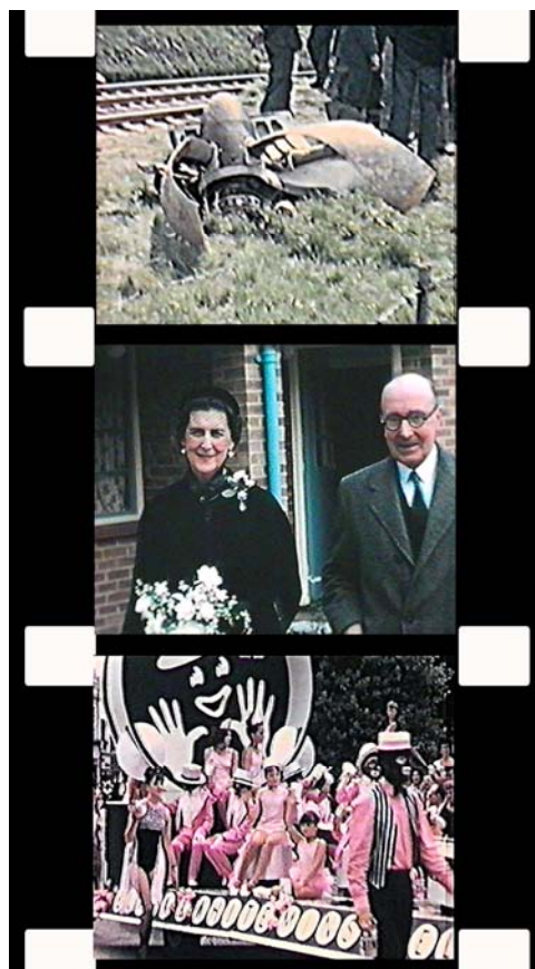
Westcliff Film and Video Club's '20th Century Newsreel'